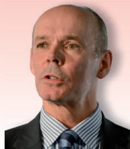
Sir Clive Woodward OBE

Portuguese Treasury and Debt Management Agency